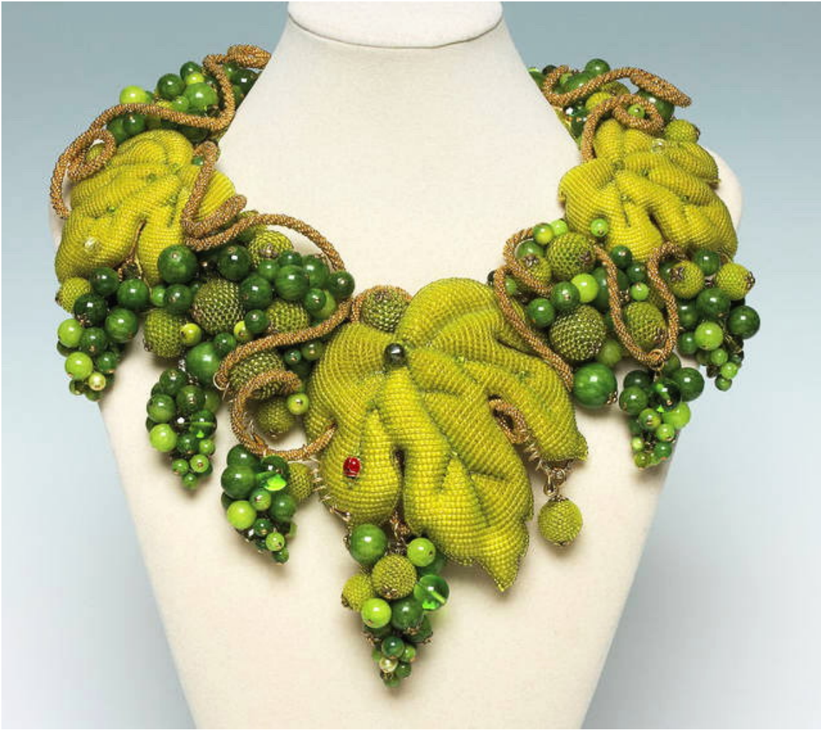
2nd Place – Stormy Petrel by Ann Braginsky, Israel