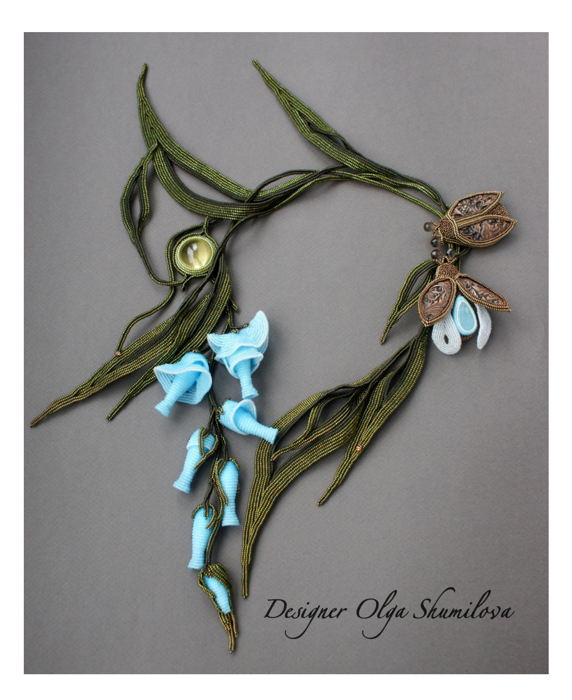
Objects or Accessories

1st place — "Lady" by Tomiko Sakanaka (Japan)