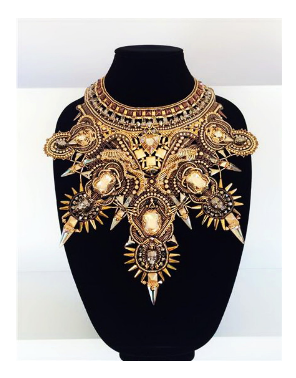
3rd place — "Phoenix" by Megumi Saso (Japan)