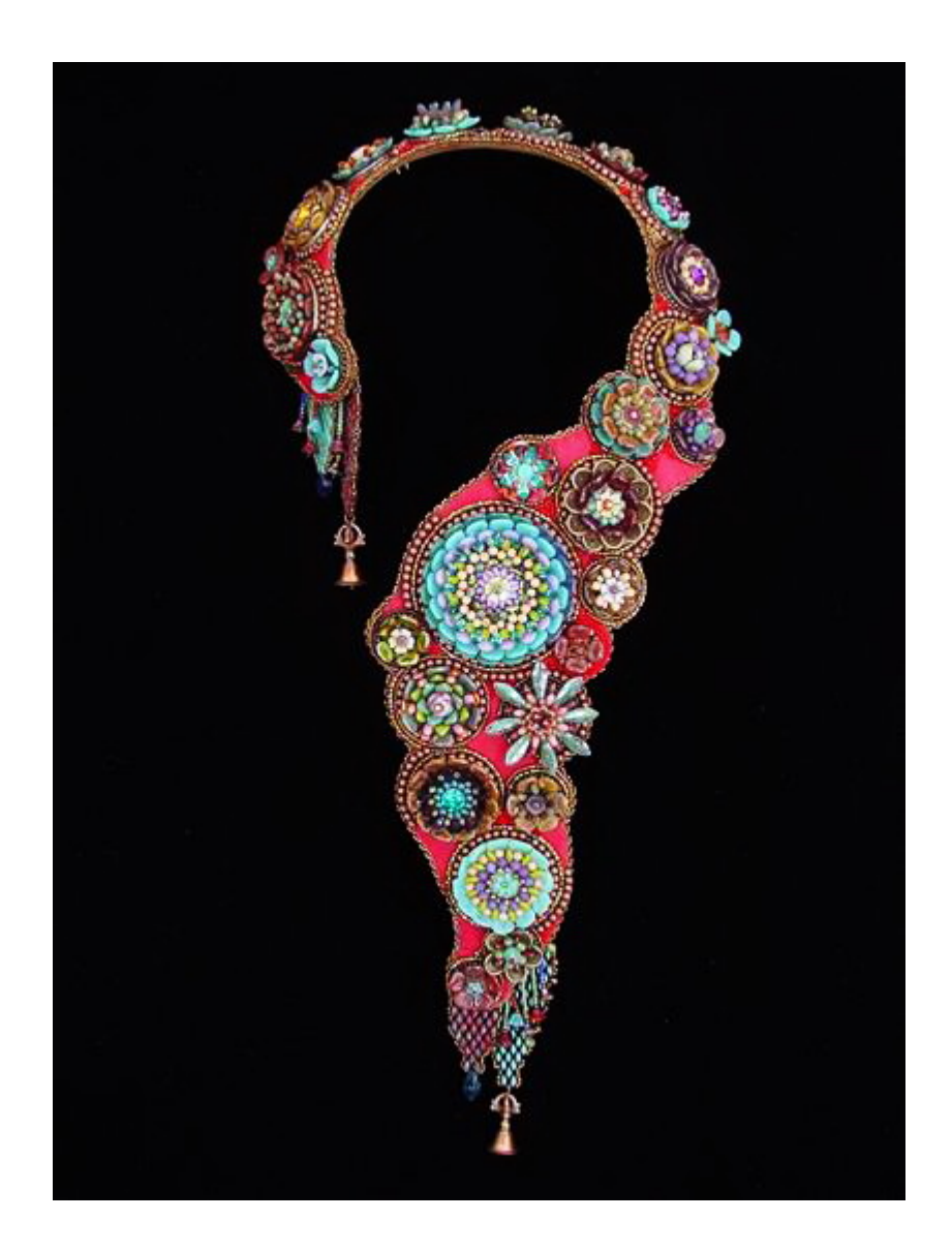
3rd place — "Tete-a-tete" by Olga Victoronva Shumilova (Russia)