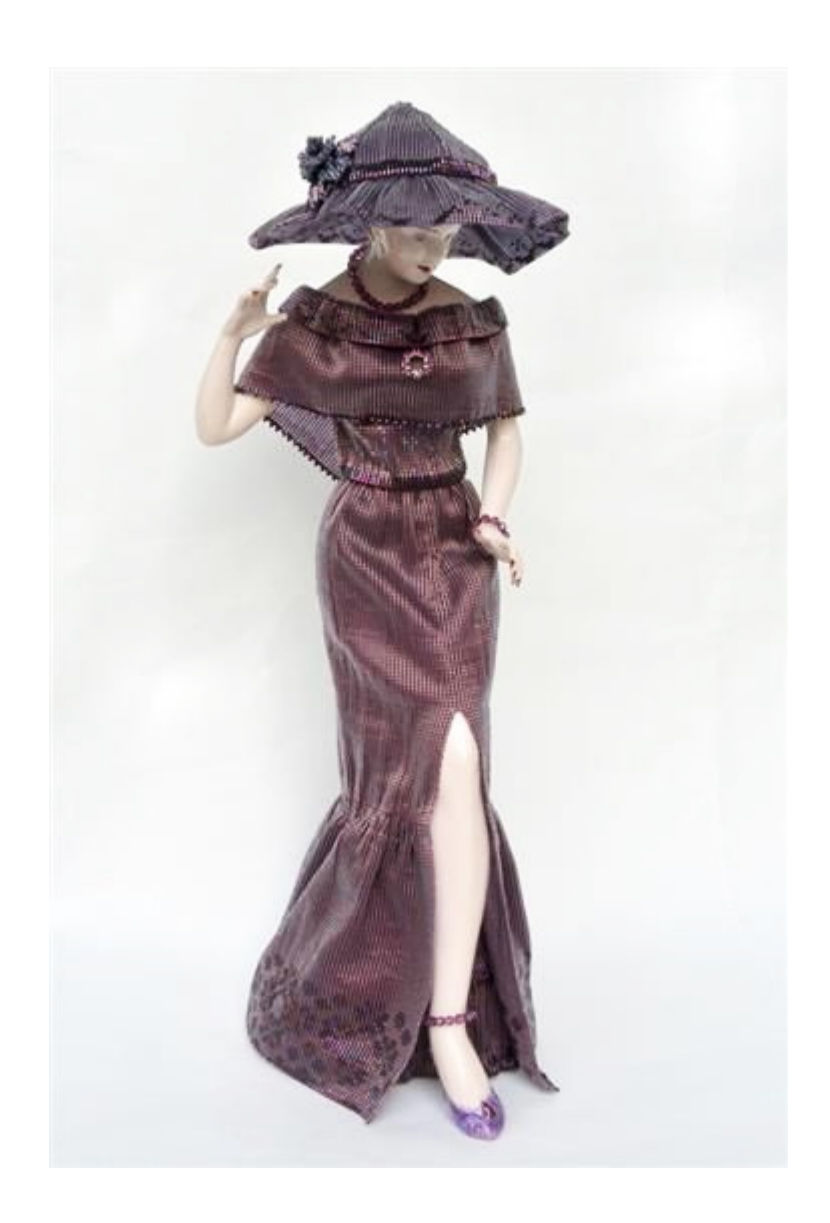
2nd place — "Free Spirit" by Pamm Horbit (Washington)